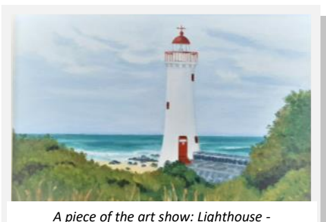
A piece of the art show: Lighthouse -Griffiths Island Port Fairy, by Jill Turpin