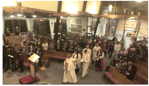
The procession at the beginning of the Commissioning Service