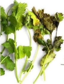
Had herbs wilting too fast