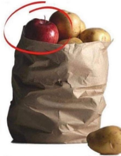
Stores potatoes with an apple to prevent sprouting