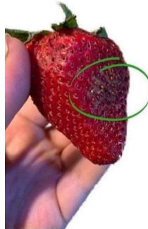
Cut off strawberry's mushy imperfections