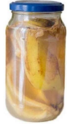
Lets banana peels sit in water for 2 days then uses that water as plant fertilizer