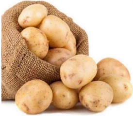
Stored potatoes alone