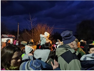
Ukrainian refugees fleeing into Hungary.