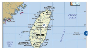
Taiwan Taiwan.

Next year's service will be hosted by St David's Moorabbin and the focus will be on Taiwan.