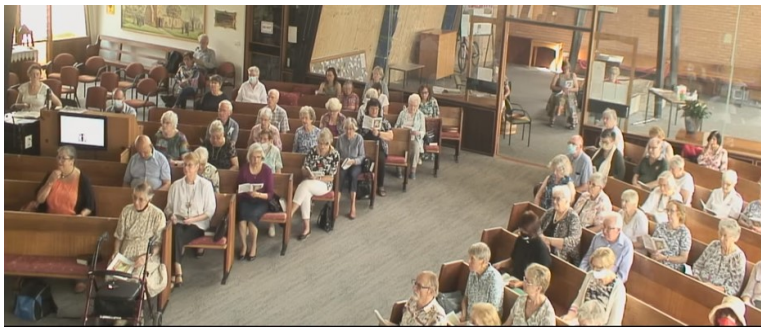
Congregation on Friday 4th March during the World Day of Prayer service.

The church was decorated with Peace Lilies, one of the symbols used in the artwork for this year's service.