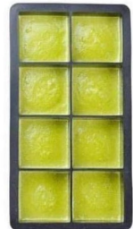
Juices lemons and freezes the lemon juice to have lemon juice all year round