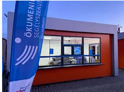
Refugee support point in set up by Hungarian Interchurch Aid at the border with Ukraine.