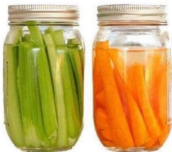
Stores carrots and celery submerged in water. Celery will last up to 2 weeks , and carrots up to 1 month