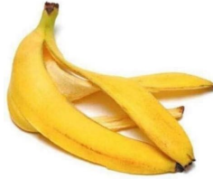
Composted banana peels