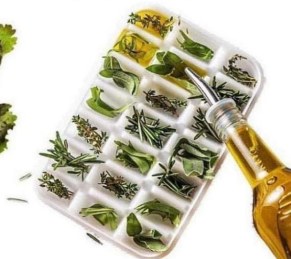
Freezes herbs in olive oil before they wilt