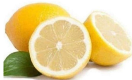
Had too many lemons and couldn't use them all before they went bad