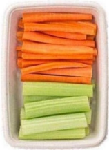
Stored carrots and celery in a container