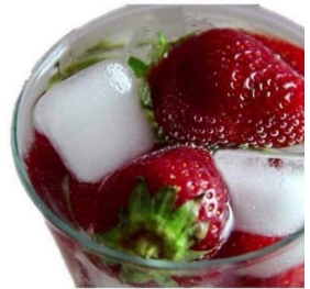
Puts strawberries with imperfections in ice water for 20 min , they come out firm and bright